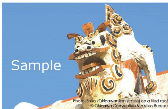
Fig. 2 An example of two or more lines of caption. In this case, the caption should be flushed left under the figure. Make one line space (or equivalent) above the figure caption.

letter of the word “Table” should be capitalized, followed by the table number and period, then the caption with the first letter of main words capitalized, all centered above the table as shown below. Use horizontal rules above and below.